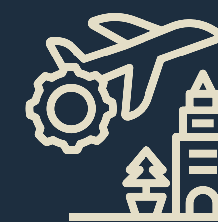
Tourism & Hospitality