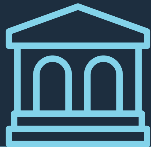
Banking & Financial Services