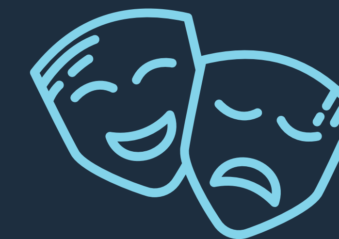
Arts, Culture & Entertainment