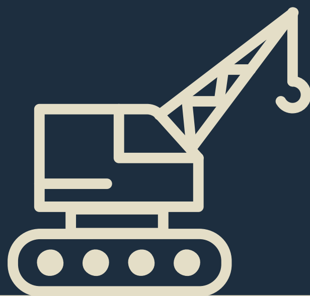
Real Estate & Construction