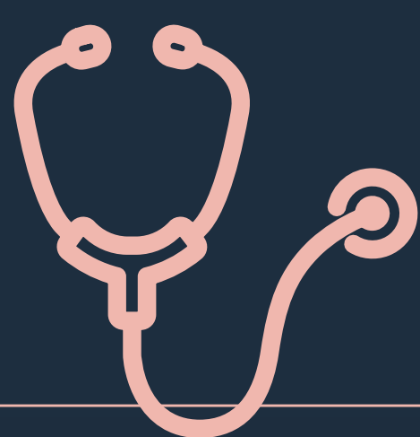
Healthcare & Sports