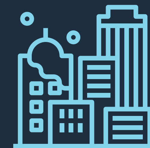
Cities & Regions