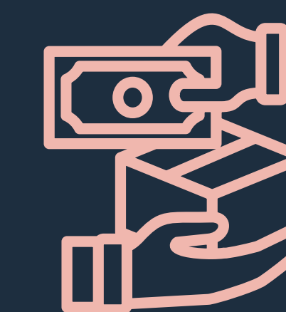
Trade & Logistics